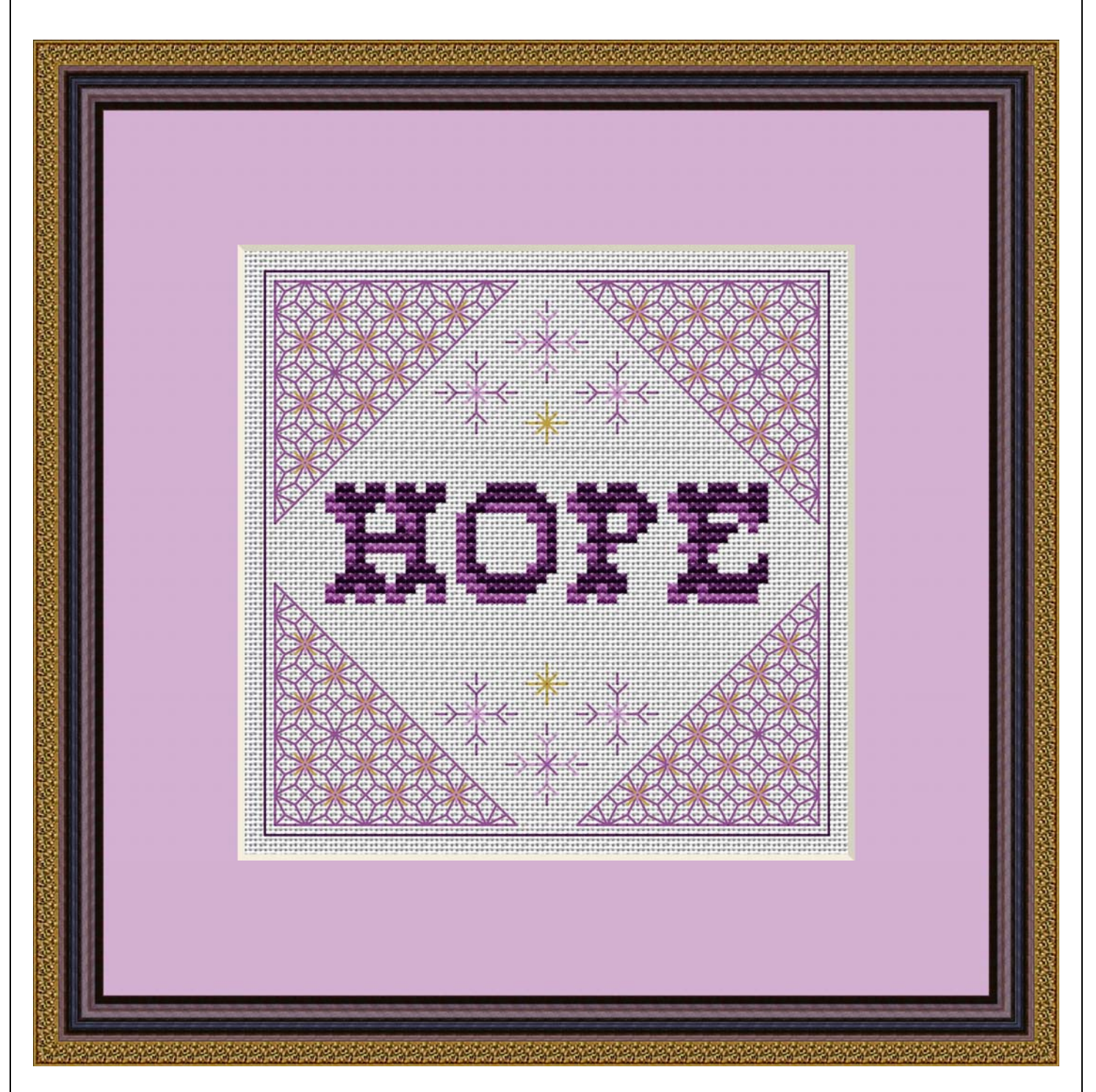
Look to the future with confidence and hope!